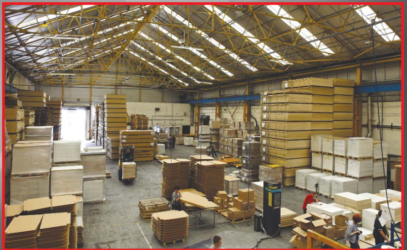
Pack and Despatch

VCi have been successfully reassessed for both their ISO9001:2008 Certification and their FSC accreditation. Continual improvement in quality and service is the company ethos, borne out again by the recent successes.